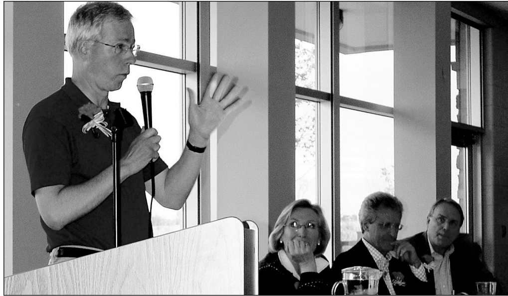
Liberal leadership hopeful Stephane Dion makes a point while fellow candidates, from left, Carolyn Bennett, Joe Volpe and Ken Dryden look on during Saturday's all-candidates meeting at the Gellert Community Centre.

"The warm Liberal welcome I received made all the difficulties of arriving there entirely worthwhile," said Dion, referring to