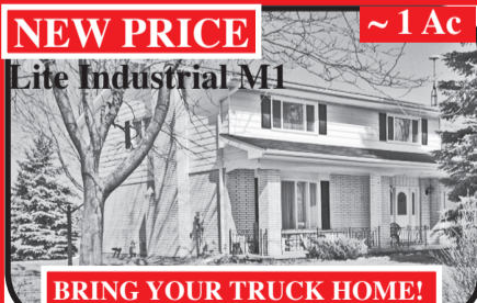
Rockwood: on Hwy 7: Home + Shop

Fab 5.25ac estate w over 4000 sqft of living space. Barn (40' x 24') w 3 oak horse stalls. Out building (2,700sq ft w heat & CAC) divided into: games rm (756 sq ft); shop (1270 sq ft) w 2 offices & 2pc & utility gar (675 sq ft), all in excel condition. Loc on private parcel w stream & 2 ponds. Just N of Oustic & 5 min E of Fergus. ~35 min to Georgetown & GO.