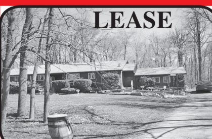
Halton Hills: 8413 Eighth Line, 0.8ac

Unique Finoro bungalow with loft bdrm (w ensuite) in quiet cul-de-sac. Adaptable for wheelchair use. Open concept. Main floor laundry room. Door from gar into home. Full unfin basemnt w high ceilings, large windows & rough-in WR. Large cold rm. Pool sized, pie shaped lot. Rear: 60ft. Park 3 cars. Drvwy, grass & landscaping to be completed by builder.