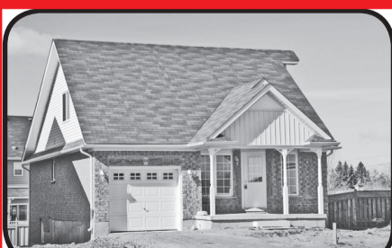
Acton: 104 Doctor Moore Court

"Hasmat Building" (explosion proof) on corner lot, 213ft x 283ft. Zoned M2. 1.77ac, with fenced outside storage. Approx 8000 sqft: 6000sq ft industrial & 2000sq ft office. Large lunch rm. Near Airport Rd & Hwy 407. Across the road from Cryslar.