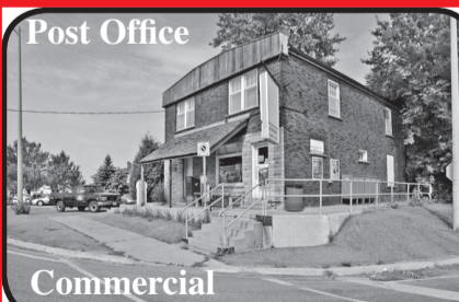
Hornby: 12993 Steeles Ave. H.Hills

Zoned Rural Industrial Large, 5+1 bdrm, 3 wash-room home on ~1 acre, W of Acton. New windows, doors, eaves/soffits, deck, attic insulation, natural gas furnace, 200 amp, CVAC & survey. LR with wood burning FP. Large kitchen. Fam rm with w/o to deck, door to laundry room/3 pc & gar. Shop (~35' x 17'). Ground prepared for new 4000 sq ft office. $499,000