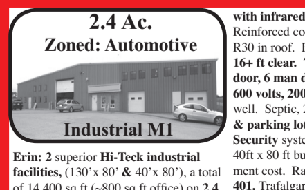
Erin: 2 superior Hi-Teck industrial facilities, (130' x 80' & 40' x 80'), a total of 14,400 sq ft (~800 sq ft office) on 2.4 acres, zoned M1 with outside storage. Crane rails for 3 ton cranes. Heated

LEASE Spacious 3 bdrm, 2 wr bungalow in quiet rural treed setting close to 401 & 407. 5 appliances. Double garage. Pkg ~10. $2000/mo. + utilities. No pets. Lawn maintenance & snow removal is the responsibility of the tenant. Bring credit check & references.