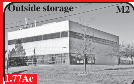
Brampton: 2400 North Park Drive

Zoned C1. Trafalgar & 401. General Store, 2 bdrm apartment upstairs, post office & used car sales lot. Zoned Commercial with Secondary Residential & Institutional uses. "As is". Offers conditional upon the Post Office remaining will be entertained.