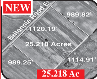
Milton: 1230 Britannia Rd E

Not in Greenbelt! East of Trafalgar Rd, South side. 1120 feet frontage on Britannia Road. Almost square 25.218 acres. Flat arable land. 2 new drilled wells, 10 gal/min & 3 gal/min. 2 driveway entrances, one on West field (30'), one on East field (60'). Natural gas at the road. Survey available. Golf course being set up to West of this property. Great investment property.