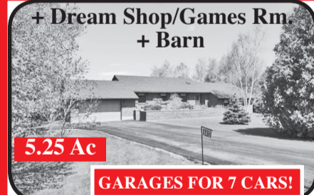
North of Rockwood: + Shop & Barn

This is it! Character home on park/camp-like 50 acres North of Rockwood on paved rd 3+1 bdrm, 2 washrms. Open concept, Great rm with cathedral ceiling & skylights. Geo Thermal furnace. Drive shed (~44'x30') with guest apt. Pole barn. Pond, trees, stream!!!