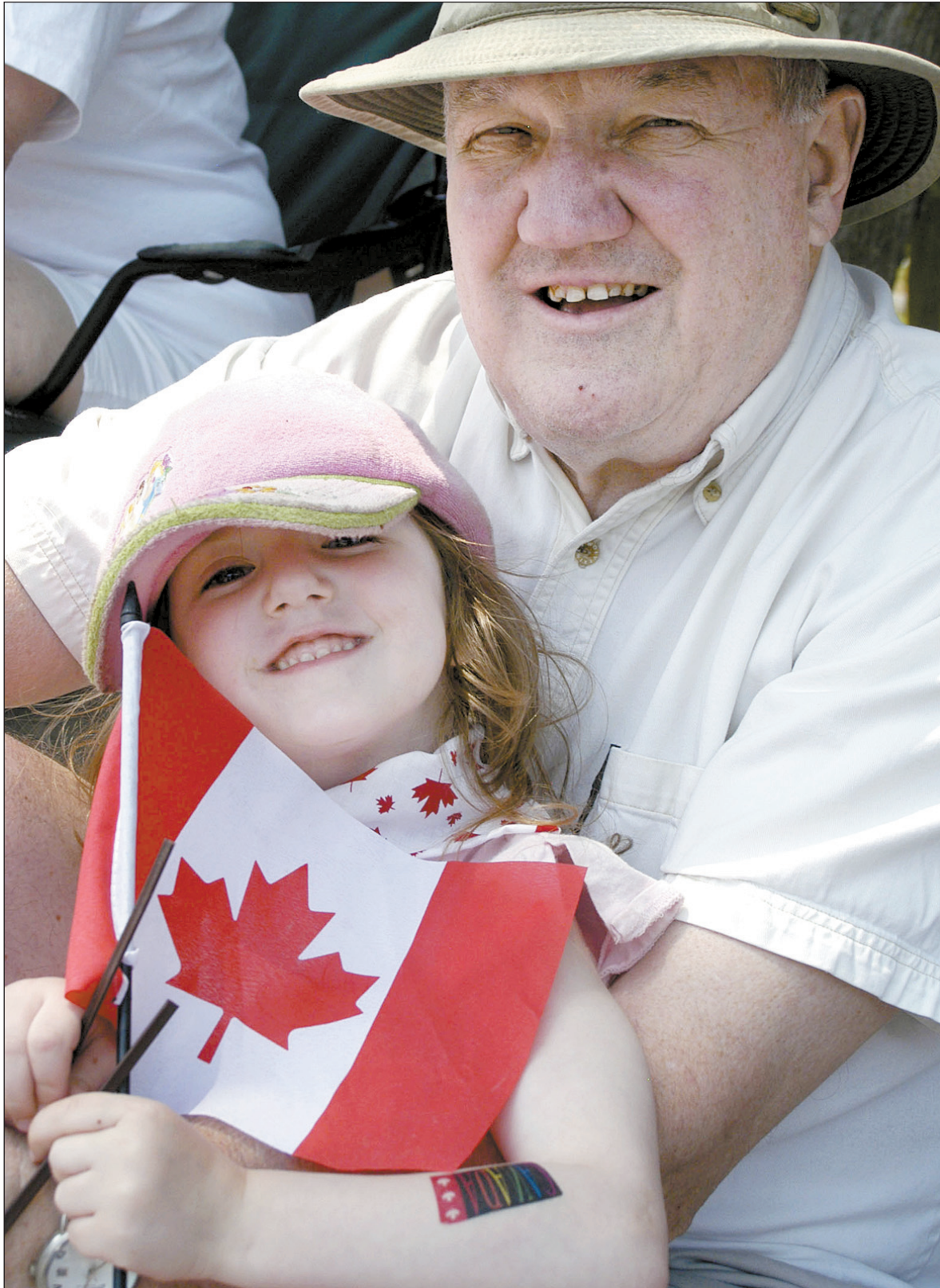
Waving the flag

School board officials are optimistic that provincial funding will come through for new school construction. See the report in Friday's edition.