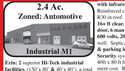
2.4 Ac. Zoned: Automotive Industrial M1

"Hasmat Building" (explosion proof) on corner lot, 213ft x 283ft. Zoned M2. 1.77ac, with fenced outside storage. ~8000 sqft: ~6000 indus & ~2000 office. Large lunch rm. Near Airport Rd & Hwy 407.