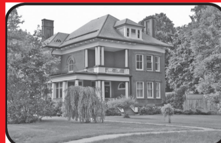
Acton: 98 Church St., Halton Hills

"Moorecraft". 1896!! Impressive central hall. LR with hrdwd fl, curved wall & FP. Library with pocket doors, hrdwd fl, b/in bookcase & stained glass! 4+ bdrms. 3 WRs. Bsmt with rec rm, 3pc & wine cellar. 1/g pool. 2 car garage Lot: 132ft x 132' ft !!