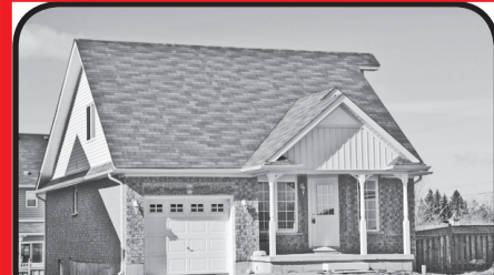
Acton: 104 Doctor Moore Court

Clean, upgraded 4bdm 2 wr, TH backing onto tennis courts & park. 2 huge bdrms. Finishd bsmt. Hardwood flrs. New furnace. Fenced. Out door pool & rec centre. Walk to school, baseball & soccer. Close to shops, public transit, churches & GO. Family oriented complex.