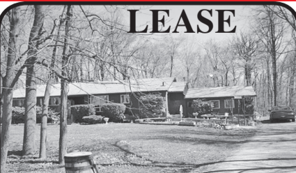
Halton Hills: 8413 Eighth Line, 0.8ac

Unique Finoro bungalow with loft bdrm (w ensuite) in quiet cul-de-sac. Adaptable for wheelchair use. Open concept. Main floor laundry room. Door from gar into home. Full unfin basemnt w high ceilings, large windows & coil-in WR. Large cold rm. Pool sized, pie shaped lot. Rear: 60ft. Park 3 cars. Drvwy, grass & landscaping to be completed by builder.