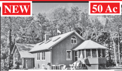
+ DRIVE SHED + POLE BARN

Fine dining 35 km West of Collingwood. Walk to Georgian Bay. Prominent location on Hwy 26. Turn key operation. Banquet Hall seats 100; DR seats 120; Coffee Shop seats 33. ~5000 sq ft on 1 ac of prime commercial land. Excellent condition. Well designed kitchen & work area. Municipal water, natural gas & sewers! Large paved pkg lot. $725K