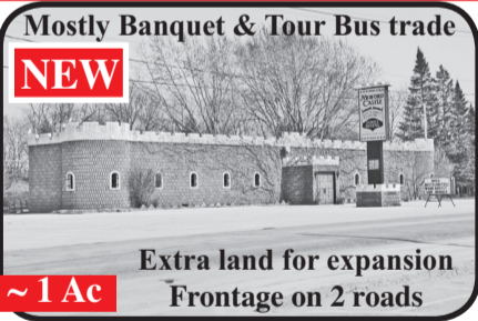
NEW Extra land for expansion ~1 Ac Frontage on 2 roads Meaford: 365 Sykes Street (Hwy 26)

"Moorecraft". 1896!! Impressive central hall. LR with hrdwd fl, curved wall & FP. Library with pocket doors, hrdwd fl, b/in bookcase & stained glass! 4+ bdrms. 3 WRs. Bsmt with rec rm, 3pc & wine cellar. 1/g pool. 2 car garage Lot: 132ft x 132'ft !!