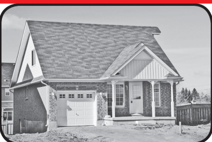
Acton: 104 Doctor Moore Court

with infrared natural gas radiant heat. Reinforced concrete floors. R20 in walls, R30 in roof. Fans. Mercury vapor lights. 16+ ft clear. 7 drive-in doors, 1 pick-up door, 6 man doors. 3 washrms. Lunch rm. 600 volts, 200 amperes, 3 phase. Drilled well. Septic, 2002. Paved driveway & parking lot. Fully fenced. 2 gates. Security system. Extra insulation in the 40ft x 80 ft building. Far below replacement cost. Rare zoning at this price. Hwy 401, Trafalgar Rd North, East on 17th SR, Erin, North side. Approximately 30 minutes to 401 at Mississauga Road.