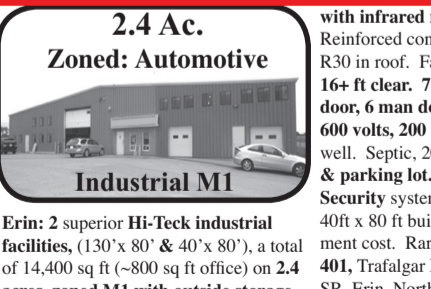
2.4 Ac. Zoned: Automotive Industrial M1 Erin: 2 superior Hi-Teck industrial facilities, (130' x 80' & 40' x 80'), a total of 14,400 sq ft (~800 sq ft office) on 2.4 acres, zoned M1 with outside storage. Crane rails for 3 ton cranes. Heated

Clean, upgraded 4bdrm 2 wr, TH backing onto tennis courts & park. 2 huge bdrms. Finish bsmnt. Hardwood flrs. New furnace. Fenced. Out door pool & rec centre. Walk to school, baseball & soccer. Close to shops, public transit, churches & GO. Family oriented complex.