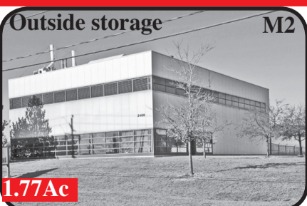
1.77Ac Brampton: 2400 North Park Drive

Spacious 3 bdrm, 2 wr bungalow in quiet rural treed setting close to 401 & 407. 5 appliances. Double garage. Pkg ~10. $2000/mo. + utilities. No pets. Lawn maintenance & snow removal is the responsibility of the tenant. Bring credit check & references.