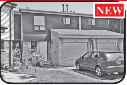
NEW Meadowvale: 5730 Montevideo Road

Zoned Rural Industrial Large, 5+1 bdrm, 3 wash-room home on ~1 acre, W of Acton. New windows, doors, eaves/soffits, deck, attic insulation, natural gas furnace, 200 amp, CVAC & survey. LR with wood burning FP. Large kitchen. Fam rm with w/to deck, door to laundry room/3 pc & gar. Shop (~35' x 17'). Ground prepared for new 4000 sq ft shop. $525,000