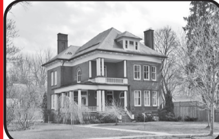
Acton: 98 Church St., Halton Hills

This is it! Character home on park/camp-like 50ac North of Rockwood on paved rd 3+1 bdrm, 2 washrms. Open concept, Great rm with cathedral ceiling & skylights. Geo Thermal furnace. Drive shed (~44'x30') with guest apt. Pole barn. Pond, trees, stream!!!