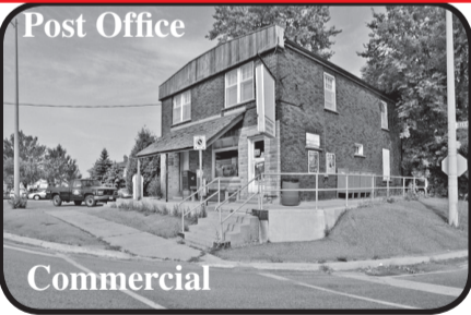
Post Office Commercial Hornby: 12993 Steeles Ave. H.Hills

Fine dining 35 km West of Collingwood. Walk to Georgian Bay. Prominent location on Hwy 26. Turn key operation. Banquet Hall seats 100; DR seats 120; Coffee Shop seats 33. ~500 sq ft on 1 ac of prime commercial land. Excellent condition. Well designed kitchen & work area. Municipal water, natural gas & sewers! Large paved pkg lot.$725K