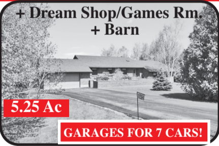
+ Dream Shop/Games Rm. + Barn 5.25 Ac GARAGES FOR 7 CARS! North of Rockwood: + Shop & Barn

Zoned C1. Trafalgar & 401. General Store, 2 bdrm apartment upstairs, post office & used car sales lot. Zoned Commercial with Secondary Residential & Institutional uses. "As is". Offers conditional upon the Post Office remaining will be entertained.