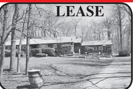
LEASE Halton Hills: 8413 Eighth Line, 0.8ac

Unique Finoro bungalow with loft bdrm (w ensuite) in quiet cul-de-sac. Adaptable for wheelchair use. Open concept. Main floor laundry room. Door from gar into home. Full unfin basemnt w high ceilings, large windows & rough-in WR. Large cold rm. Pool sized, pie shaped lot. Rear: 60ft. Park 3 cars. Drwy, grass & landscaping to be completed by builder.