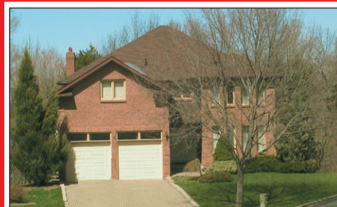
GEORGETOWN'S FINEST RAVINE, JUST OFF HESLOP COURT $599,000

On 1.28 acres, there were no shortcuts taken in the construction of this 4+1 bedroom home with over 6000 sq. ft. of living space. Featuring Marley roof, Scarlet O'Hara floating staircase, marble floors, tons of potlights, 9' ceilings, luxury upgrades throughout, call us for the list. Plus, completely finished basement with separate entrance and kitchen, huge cedar deck & patio, concrete driveway, intercom at electronic gates, triple car garage and a huge storage building for additional parking or workshop space.