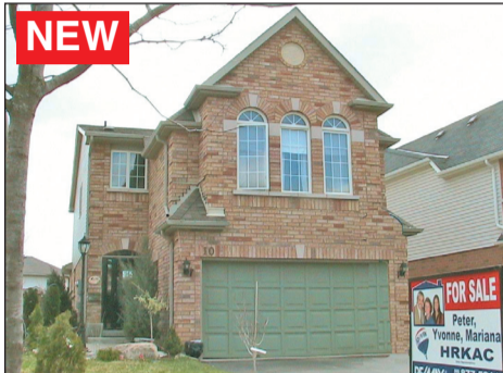
SPLASH INTO GEORGETOWN SOUTH $379,900

Unbelievable pool and backyard with landscaping out of this world. This friendly 4 bedroom, 4 washroom home features warm Tuscan decor and a customized open concept floor plan perfect for entertaining. A stunning family room with cathedral ceiling, 2 skylights, gas fireplace and laminate floor opens to a large kitchen loaded with cupboards and lots of pantry space. Crown mouldings, laminate floors and ceramic tiles on the main floor. Upper hallway with newer Berber and a master retreat you'll just love, featuring 9' ceilings, lots of windows, beautiful draperies, walk-in closet & a 4 pc ensuite with its own handy linen closet. A fully finished basement only 1 year new for the added space we could all use. Be the envy of your friends with a pool you'll love to enjoy.