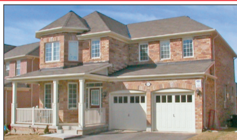
WALKOUT BASEMENT, 9' CEILINGS, SPACE GALORE... ON QUIET, PRESTIGIOUS CRESCENT $489,900

All brick, 3 bedroom, 4 bathroom home close to new GO station, schools and shopping. Clean and neutral decor with a great floor plan. Features spacious eat-in kitchen with walkout to interlock patio and fenced yard. A perfect great room for casual family comfort. Handy main floor laundry with interior access to double car garage. Spacious bedrooms plus cozy & comfortable computer area in upper hall. Basement partially finished. Upgraded trim throughout. Call us quick!