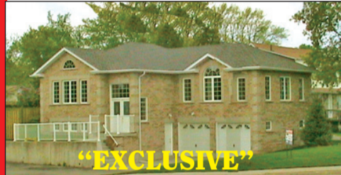
EVERYTHING DONE FOR YOU... LANDSCAPING, FENCE, THE WORKS...IN THIS BRAND NEW, STUNNING RAISED BUNGALOW $327,500

Unbelievable pool and backyard with landscaping out of this world. This friendly 4 bedroom, 4 washroom home features warm Tuscan decor and a customized open concept floor plan perfect for entertaining. A stunning family room with cathedral ceiling, 2 skylights, gas fireplace and laminate floor opens to a large kitchen loaded with cupboards and lots of pantry space. Crown mouldings, laminate floors and ceramic tiles on the main floor. Upper hallway with newer Berber and a master retreat you'll just love, featuring 9' ceilings, lots of windows, beautiful draperies, walk-in closet & a 4 pc ensuite with its own handy linen closet. A fully finished basement only 1 year new for the added space we could all use. Be the envy of your friends with a pool you'll love to enjoy.