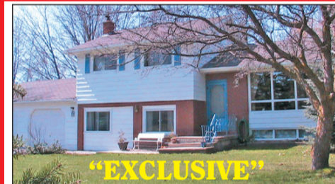
GET OUT OF TOWN $339,900

Drive up to this parklike property and you won't want to leave. Total privacy as it sits tucked up beyond a sea of majestic trees, overlooks a gorgeous pond, and features many amazing gardens with two ponds and a steel barn with 3 paddocks . . . all only minutes to town. Sprawling 3 bedroom, ranch bungalow with updating done for you, all the old but charming with the new modern decor you'll love. Completely immaculate. Clean, true moves here. Large and cozy principal rooms. Fully and fully finished walkout basement with 2 bedrooms, 2 bathrooms and all the extra living space you could ever want. Your own part features huge rec room, office/bdrm, kitchen and entertaining area . . . and another whole section with the perfect set up for a teenager or in-law to call their own. You'll have to come out and see it to believe it.