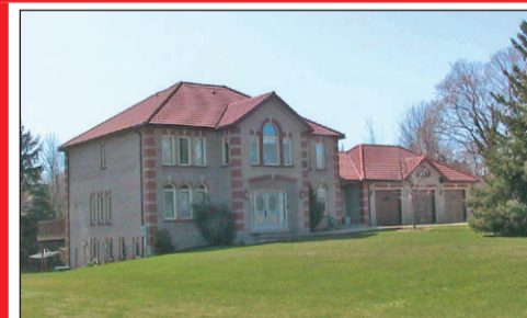
HUMUNGOUS HOME BUILT FOR ROYALTY $847,000

On over an acre lot. Over $80,000 in upgrades. Marvelous finishes inside: 9' ceilings, custom kitchen cabinets that will blow u away, blend of ceramic, hardwood and stylish Berber, stunning ensuite with extended glass shower and tub. Loads of potlights and nice detailing throughout. Mix of stone and brick, 3 car drywalled garage, town water, gas and cable, basement prepped for finishing. Call us before this one's gone too.