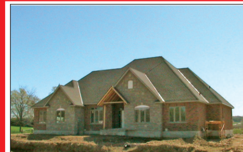
BRAND NEW CHARLESTON BUILT. READY TO MOVE IN $639,900

Take your pick investors. Call Peter for full details.