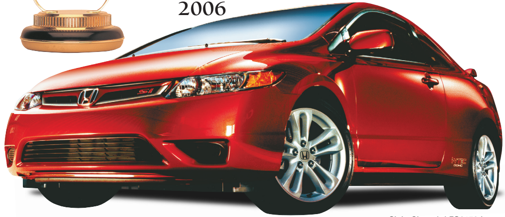
Civic Si model FG2156J