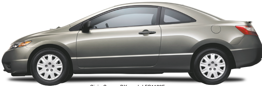
Civic Coupe DX model FG1126E

The driving thrills of Honda's next generation technology, in Canada's most affordable hybrid. hondaontario.com/civichybrid/fuelefficiency $25,950 MSRP