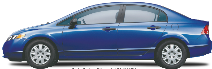
Civic Sedan DX model FA1526EX

Civic Coupe pours it on with new levels of performance, style and driving enjoyment. hondaontario.com/civic/features $17,180 MSRP