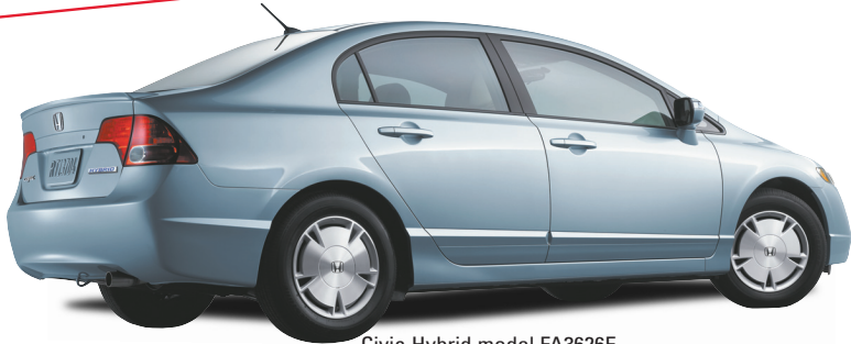
Civic Hybrid model FA3626E