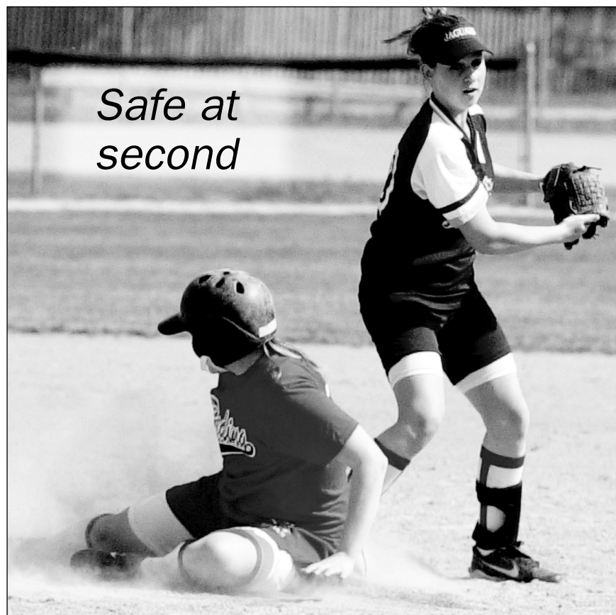
Safe at second