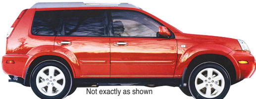
Not exactly as shown

LEASE FOR $309 /MONTH FOR 60 MONTHS $5000 Down tax-incl. - 3000 Cash back. $2000 Down (cash or trade)