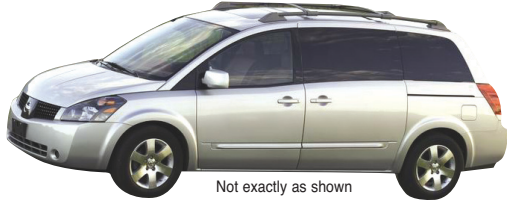
Not exactly as shown

LEASE FOR $357 /MONTH FOR 60 MONTHS $5000 Down tax-incl. - 2000 Cash back. $3000 Down (cash or trade)