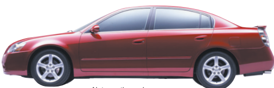
Not exactly as shown

LEASE FOR $299 /MONTH FOR 60 MONTHS $5000 Down tax-incl. - 3000 Cash back. $2000 Down (cash or trade)