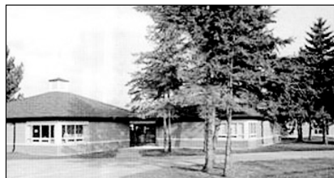
Georgetown District Christian School: Then and now