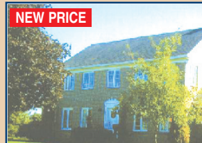
NEW PRICE CUSTOM BUILT ESTATE HOME BUILT WITH FAMILY IN MIND $559,900

Starter home in Scenic village of Rockwood close to conservation. Hours of hard work, determination & over 20 tons of rock have gone into this spectacular garden at the top of the lot. Beautiful views & privacy. Eat-in kitchen. Vinyl siding. Home needs major renovation. What do you expect for this money?