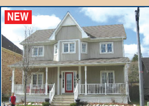
NEW BEAUTIFULLY CARED FOR & EXCEPTIONALLY DECORATED

Prestigious Rockwood Ridge. Large foyer, sep. DR with bay window, open concept kit with island & breakfast bar, ceramic flrs, eating area & w/o to fenced backyard. Kit. overlooks living rm with decorator pillars & FP. 4 bdrms on 2nd flr plus laundry. Mstr with ensuite w. jacuzzi tub & walk-in closet. 3rd flr features large fam rm with dormer. Prof. fin. bsmt with 2nd kit, rec rm/liv rm, 4 pc. & 5th bdrm. CAC. Min. to park & conservation area.