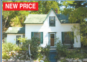
NEW PRICE A GARDENER'S PARADISE $139,000

1250 sq. ft. bungalow on large fenced lot with mature trees. 3+2 bedrooms, large eat-in kitchen, fully finished basement, many recent upgrades. Close to library, rec center and parks. Call Deb Patterson*.