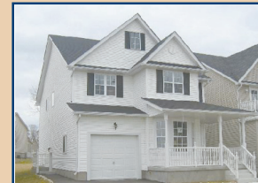
4 BEDROOM FAMILY HOME IN ROCKWOOD RIDGE

Quiet, mature & serviced estate subdivision in village of Rockwood. Spacious oak kitchen with ceramic floor, centre island & built-in appliances overlooking bright sunken breakfast area with ceramic floors & cathedral ceilings. Forming dining room with hardwood floors, den with cathedral ceilings, main floor family room with pocket doors, wood fireplace & walkout to deck & treed & landscaped backyard. 3 bedrooms, master bedroom with 5 pc ensuite & walk-in closet. Finished lower level with large recreation room with gas fireplace, office or 4th bedroom, exercise room, workshop with walkup to ample storage to double car garage, main floor laundry. Central air, central vac. Quiet neighbourhood, prestigious area.