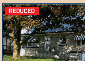
REDUCED MATURE LOT, FAMILY HOME $259,500

Living room and dining room combination with french doors. Eat-in kitchen, walkout to side and back deck and treed backyard. Most updated windows, forced air gas heating with central air conditioning, 4 bedrooms, large finished rec room with gas fireplace. Family neighbourhood.