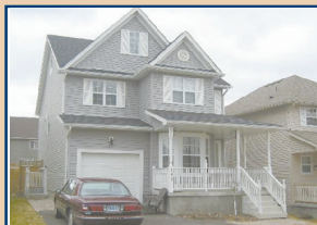
ALL THE SPACE NEEDED FOR THE GROWING FAMILY - ROCKWOOD $359,900

3 bedroom bungalow, hardwood floors, close to lake. Finished basement with 3 pc., gas fireplace and extra bedroom, separate entrance, private lot.