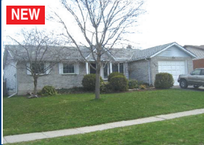
NEW MOVE IN AND ENJOY $289,900

1250 sq. ft. bungalow on large fenced lot with mature trees. 3+2 bedrooms, large eat-in kitchen, fully finished basement, many recent upgrades. Close to library, rec center and parks. Call Deb Patterson*.