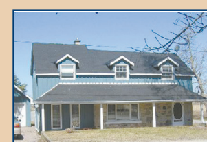
CHARMING OLDER HOME IN VILLAGE OF ROCKWOOD

Highway frontage between Acton & Rockwood. Steel shop (30' x 40'). Services are well & septic. Great opportunity to own industrial land close to Acton, Milton & Highway 401 corridor at a reasonable price. Please call Gord* to view.