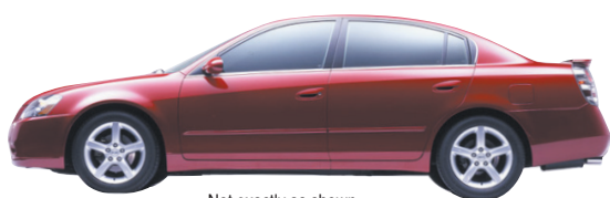
Not exactly as shown

LEASE FOR $299 /MONTH FOR 60 MONTHS $5000 Down tax-incl. - 3000 Cash back. $2000 Down (cash or trade)