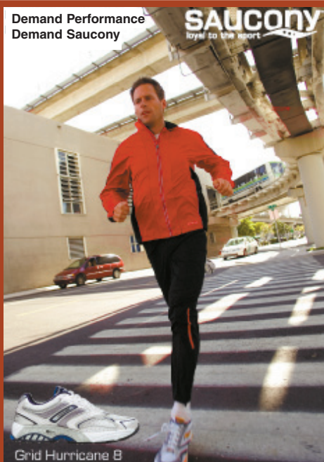
Demand Performance Demand Saucony