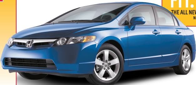
Civic Sedan LX model FA1546E

FIT. IN. THE ALL NEW 2007 FIT. NOW AVAILABLE.