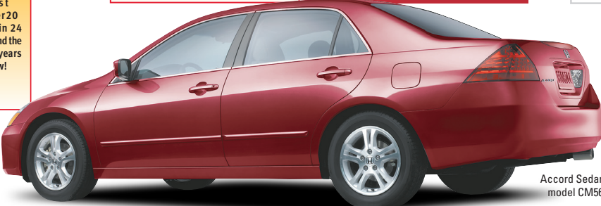
Accord Sedan SE model CM5636J

SE PACKAGE COST $3,262 YOU PAY ONLY $1,500 VALUED PRICE ADVANTAGE $1,762*