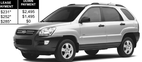
V6 model shown* MSRP $21,095**

36 MPG 7.8 L/100 KM highway fuel consumption*