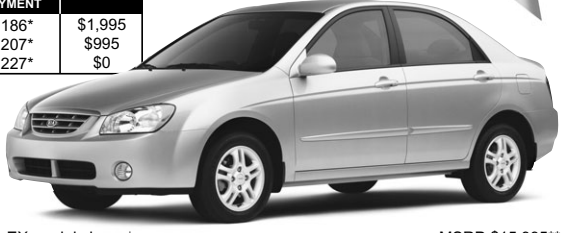
EX model shown* MSRP $15,995**

43 MPG 6.6 L/100 KM highway fuel consumption*