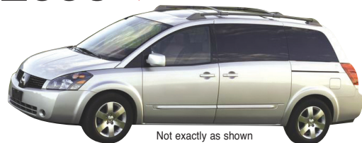
Not exactly as shown

LEASE FOR $357 /MONTH FOR 60 MONTHS $5000 Down tax-incl. - 2000 Cash back. $3000 Down (cash or trade)