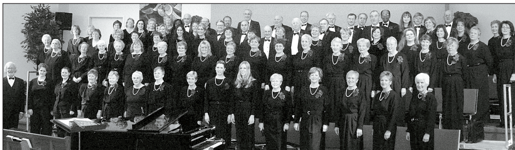
Georgetown Choral Society will perform Elijah on Friday, May 5 and Saturday, May 6. Tickets are available at The Freckled Lion or Bergsma's Paint & Wallpaper.

In this day it was rare for any oratorios to receive an ovation but, this piece became the exception! The story of Elijah was a subject that Mendelssohn had long wanted to set to music and he greatly enjoyed the work's success before his untimely death the following year aged only 38.