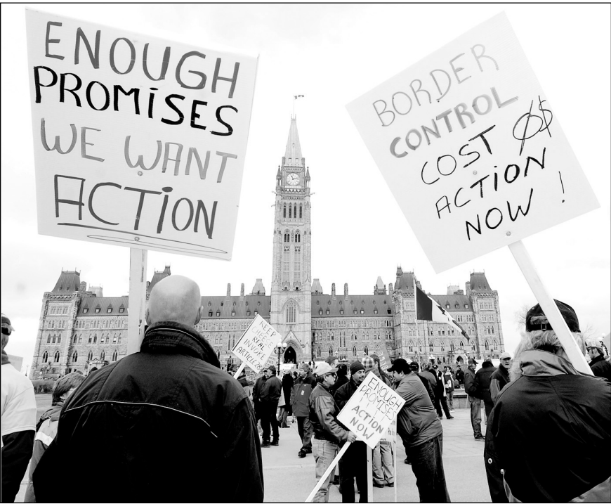
The Peace Tower on Parliament Hill was framed by protest signs Wednesday as 10,000 Canadian farmers converged to protest the lack of agricultural programs for farmers.