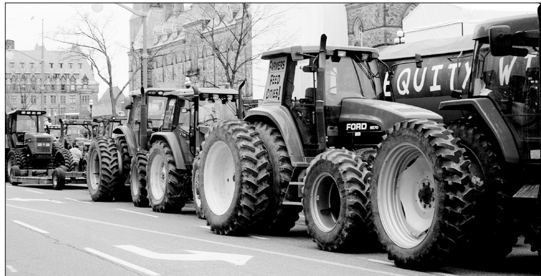
More than four blocks of Wellington Street in front of the Parliament buildings was blocked by 150 tractors as part of the protest.