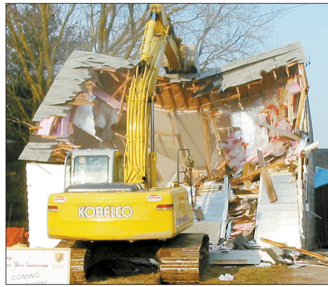
The house at 30 Churchill Cres. in Georgetown, deemed by neighbours to have been an eyesore for years, is brought down.