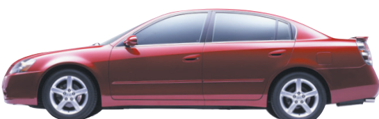
Not exactly as shown

LEASE FOR $319 /MONTH FOR 48 MONTHS $5000 Down tax-incl. - 3000 Cash back. $2000 Down (cash or trade)