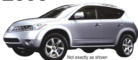
Not exactly as shown

LEASE FOR $519 /MONTH FOR 48 MONTHS $5000 Down tax-incl. - 3000 Cash back. $2000 Down (cash or trade)