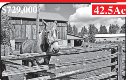
$729,000 42.5Ac Milton: Greenbelt protected, scenic

South of Georgetown. NATURAL GAS! ~49 acres of prime farmland with splendid 5 bdrm, 4 WR home. Indoor arena with 10 box stalls. 5 car garage with shop. Sun rm with walk-out to balcony. Good attic. Can be developed. New shingles. New hi-eff nat gas furnace. 3 wells. ~5 min to Georgetown & GO, ~10 min to Milton, Hwy 401 & 407.