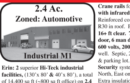
2.4 Ac. Zoned: Automotive Industrial M1 Erin: 2 superior Hi-Tech industrial facilities, (130' x 80' & 40' x 80'), a total of 14,400 sq ft (~800 sq ft office) on 2.4 acres, zoned M1 with outside storage. Approximately 30 min to Hwy 401.

Zoned Rural Industrial Large, 5+1 bdrm, 3 wash-room home on ~1 acre, W of Acton. New windows, doors, eaves/soffits, deck, attic insulation, natural gas furnace, 200 amp, CVAC & survey. LR with wood burning FP. Large kitchen. Fam rm with w/o to deck, door to laundry room/3 pc & gar. Shop (~35' x 17'). Ground prepared for new 4000 sq ft shop. $525,000