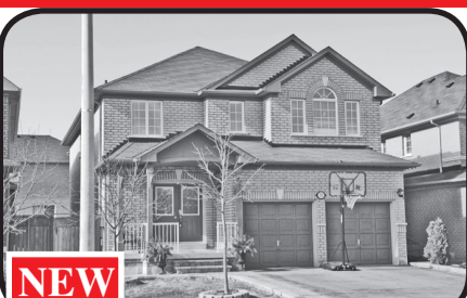
NEW Brampton: 72 Barleyfield Road

Gorgeous executive home built by Starlane, 2810 sq ft, with main floor den. ~6 years old. Great curb appeal. Covered porch with pillars. Interlocking brick path ways & rear patio. Upgrades: ceramic tiled flr in foyer, hall & kit; hrdwd on main level, parquet floors on upper; oak staircase, pillars & fenced yard. Incl: dishwasher, stove, fridge, security system.