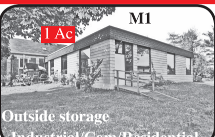
1 Ac M1 Outside storage Industrial/Com/Residential Halton Hills: 13029 Steeles Ave, West

Zoned C1. Near Trafalgar & 401. Presently: General Store, 2 bdrm apartment upstairs, post office & used car sales lot. Zoned Commercial with Secondary Residential & Institutional uses. Municipal water & sewers will be available before the end of 2006. "As is". Exclude contents. Offers conditional upon the Post Office remaining are acceptable. Great location.