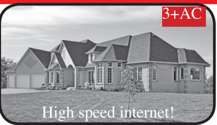
3+AC High speed internet! Halton Hills: Estate Subdivision

"Moorecroft". Authentic Queen Anne, 1896. Columns! Wrap around porch! Inviting vestibule. Impressive central hall. LR with hrdwd fl, curved wall & FP. Library with pocket drs, hrdwd fl, b/i bookcase & stained glass! DR with hardwood floor & FP. 4+ bdrms. 3 WRs. Bsmt with rec rm, 3pc & wine cellar. 1/g pool. 2 car gar. Lot 132x132. Heritage!