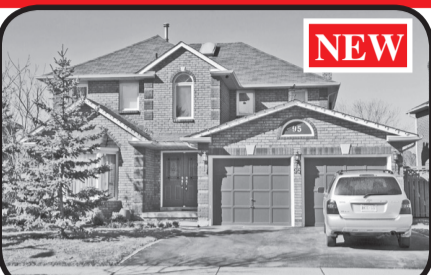
NEW Brampton: 95 Kenpark Avenue

Hwy 25. Highly upgraded: kit with 2 Jenn-air stoves, b/i microwave, centre island, granite counter tops, extra cabinets; Fam rm with floor to ceiling fireplace; lower level with games rm, exercise rm (5th bdrm); powder rm, play room & media room with walkout. Professionally decorated. Hi-speed internet, Cogeco! Located between Acton & Milton.