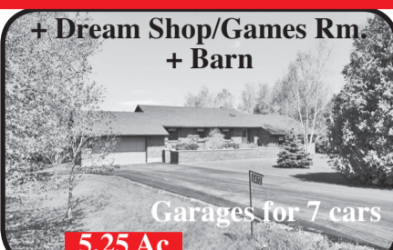
+ Dream Shop/Games Rm + Barn Garages for 7 cars 5.25 Ac North of Rockwood: + Shop & Barn

Lovely 2360 sq ft, 4 bdrm, 4 WR home on 60' x 135' lot in prestigious Stonegate. Kit with walk out to deck overlooking in ground pool. Fam rm with gas FP. Hardwood in LR, DR, kit & Fam rm! Prof finished bsmt with rec rm, 3pc, games rm & weight rm. Huge rear yard with kidney shaped, i/g pool. Surrounded by park land, pond & walking/bike trails.