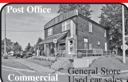
Post Office Commercial General Store Used car sales Hornby: 12993 Steeles Ave. H.Hills

Rare, secluded, picturesque land with ~25acre mature forest, 8ac hay, 4ac pasture, riding ring & groomed trails. < 35 min to airport. Gently rolling w old stone walls, mature trees & creek. Bank barn. Drive shed. 2 bdrm (was 3br) bungalow on knoll w MF Indry. 2 walkouts to deck under mature trees. Loc next to 50 acre Agreement Forest with groomed trails.