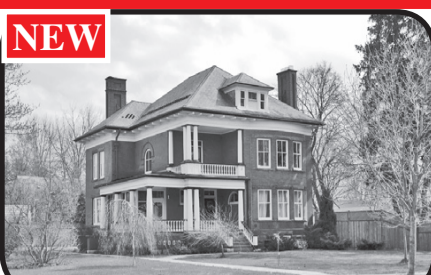
NEW Acton: 98 Church St., Halton Hills

Gorgeous executive home built by Starlane, 2810 sq ft, with main floor den. ~6 years old. Great curb appeal. Covered porch with pillars. Interlocking brick path ways & rear patio. Upgrades: ceramic tiled flr in foyer, hall & kit; hrdwd on main level, parquet floors on upper; oak staircase, pillars & fenced yard. Incl: dishwasher, stove, fridge, security system.