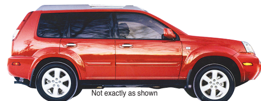
Not exactly as shown

LEASE FOR $329 /MONTH FOR 48 MONTHS $5000 Down tax-incl. - 3000 Cash back. $2000 Down (cash or trade)