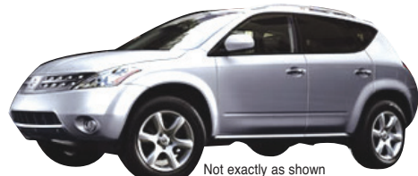
Not exactly as shown

LEASE FOR $519 /MONTH FOR 48 MONTHS $5000 Down tax-incl. - 3000 Cash back. $2000 Down (cash or trade)