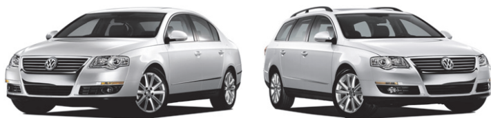
Sedan and Wagon