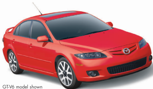
GT-V6 model shown