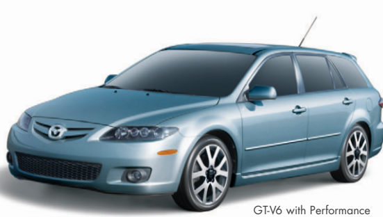
GT-V6 with Performance package model shown

NO SECURITY DEPOSIT LEASE PAYMENT INCLUDES FREIGHT AND P.D.E.