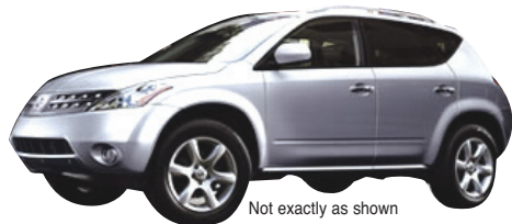
Not exactly as shown

LEASE FOR $519 /MONTH FOR 48 MONTHS $5000 Down tax-incl. - 3000 Cash back. $2000 Down (cash or trade)