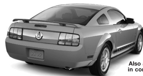
Also available in convertible