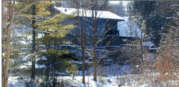
COUNTRY CHARM - IN TOWN CONVENIENCE

Amazing details, hardwood floors, original coal fireplace with amazing copper front, decorative & authentic tin ceilings, updated spacious, eat-in kitchen, walkout to large mature yard, mn floor family room and more!!! $424,900. MarthaSummers.ca 06-192-30