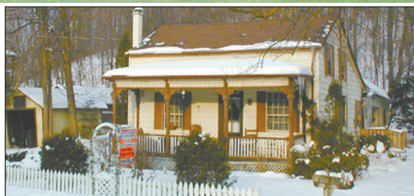
CHELTENHAM CHARMER $280,000

Quality custom built in an enclave of estate homes, 4 bdrms, huge eat-in kit overlooking inground pool, main floor family rm, hrdwd flrs, fireplace, beamed ceilings, w/o to patio. Close to "GO", skiing, golf & Bruce Trail. 3 pretty acres. $699,000. MarthaSummers.ca 06-227-60