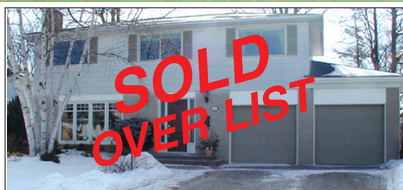
FABULOUS ADDITION OVERLOOKING THE RAVINE

Fabulous home, exposed log interior, stunning kitchen, slate floors, great room, stone fireplace, cathedral ceiling, superb dining room, w/o to wrap-around deck overlooking the hills of Erin. Finished walkout lower level. 2 road frontages. Something very special!!! MarthaSummers.ca 06-21-91