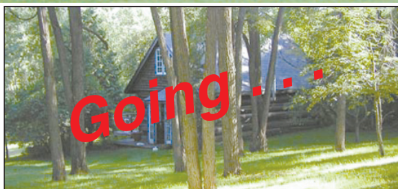
LOOKING FOR THAT DREAM PROPERTY?

1850's on a 131 x 206 mature lot in this charming village. Minutes to "GO" "Great footprint" to do a complete reno or enjoy what is already there. Historic 12 over 8 windows plus a charming front verandah. MarthaSummers.ca 05-701-60