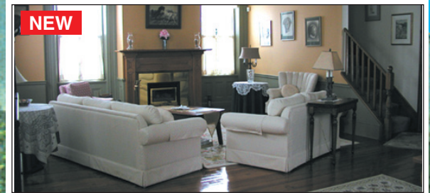
CENTURY CHARM - 1.9 ACRES - CALEDON