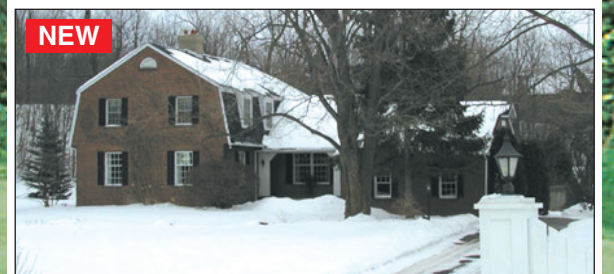
CUSTOM HOME - MATURE SETTING - BELFOUNTAIN

Endless possibilities. 157 x 165 ft. lot, 3 bdrm charming home overlooking ravine with separate large office area with 2 piece and 2 lower offices at walkout which could easily be changed to additional living space for the main home. Overlooks conservation owned land. MarthaSummers.ca 06-156-90