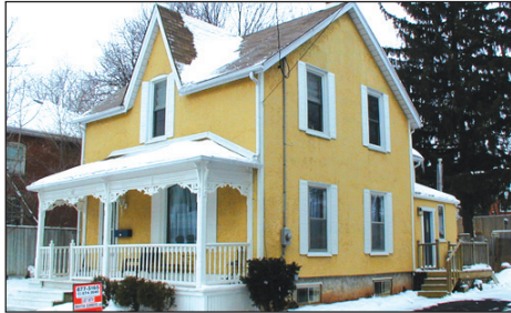
CENTURY - 4 BEDROOM - GREAT YARD

Gracious 3 bdrm, large principal rooms. Open concept kit., large eating area, overlooks family rm, w/o to patio. Huge great room or office or master bdrm w/walkout. Updated with all the original charm retained. $599,000. MarthaSummers.ca