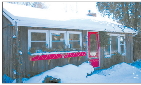
BELFOUNTAIN - DEAD END ROAD $389,000

Super custom 3 bdrm raised bungalow, finished lower level, 2nd kitchen & separate entrance. I/G pool, 30 x 40 garage/workshop + additional storage building. Minutes to "GO". 1st time offered. MarthaSummers.ca 06-119-19