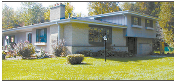
COUNTRY IN TOWN

It's just done right + take a closer look at this amazing horse property on a superb gently rolling 57 acres with stream, woods, paddocks, trails, sand ring and more. Dutch Master indoor arena, 8 stalls with room for more. Century home with 3 bdrms, 3 baths, open concept and charming. What are you waiting for? $999,000. MarthaSummers.ca 05-577-91