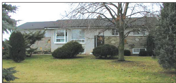
1/2 ACRE AT BOVAIRD & HERITAGE $519,000

The warmth of wood. Nestled in a mature lot, open concept with wood floors, floor to ceiling brick fireplace, large master bedroom, great height in lower level with lots of room to develop. $400,000. MarthaSummers.ca