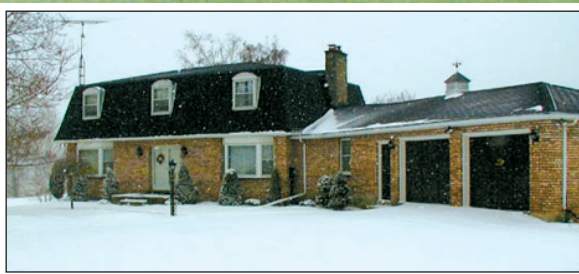
SWIM ALL YEAR $599,000

Amazing!! Cherry Barzotti kitchen open to dining room and family room, cherry floors + spectacular views. Master bedroom with cherry floors, dressing room, designer bathroom. Quality Otten & Otten renovations and additions. MarthaSummers.ca 06-203-30