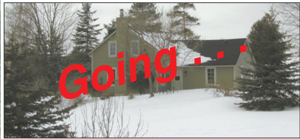
HORSEY?? SUPERB SOUTH EAST ERIN LOCATION!!

It's just done right + take a closer look at this amazing horse property on a superb gently rolling 57 acres with stream, woods, paddocks, trails, sand ring and more. Dutch Master indoor arena, 8 stalls with room for more. Century home with 3 bdrms, 3 baths, open concept and charming. What are you waiting for? $999,000. MarthaSummers.ca 05-577-91