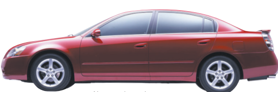
Not exactly as shown

LEASE FOR $319 /MONTH* FOR 48 MONTHS $5000 Down tax-incl. - 3000 Cash back. $2000 Down (cash or trade)