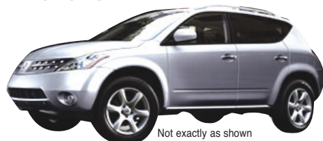
Not exactly as shown

LEASE FOR $519 /MONTH* FOR 48 MONTHS $5000 Down tax-incl. - 3000 Cash back. $2000 Down (cash or trade)