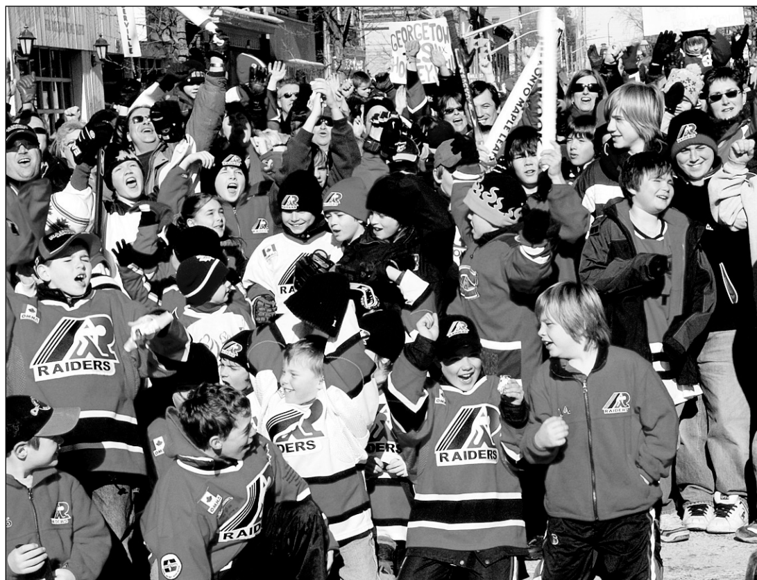
Main Street in downtown Georgetown was turned into a street hockey venue Sunday as local organizers are bidding to have the town named Hockeyville— as part of a CBC reality show set to air later this month. CBC crews filmed the event and were expected back last night at Memorial Arena to film a local minor hockey playoff game.

Call toll free at 1-866-314-HFHH (4344) today! Website – www.habitathalton.ca