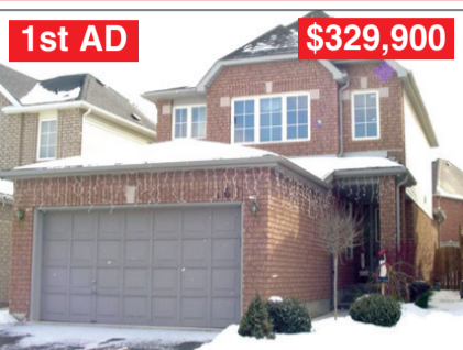
1st AD $329,900

Why not come out and support these young men as they represent Georgetown.