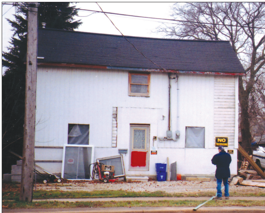
This is how the house at 52 Confederation Street looked prior to the Town of Halton Hills demolishing it last week. The Town contends the owners were given numerous chances to repair the home, but failed to meet a number of deadlines.