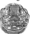
11ct Emerald Ring

Original Acrylics by Peter Max - Original Pastels and Charcoals by Pissarro - Hand signed artwork by Chagall, Dali, Matisse, Degas, Picasso, Erte, and other 19th & 20th Century Masters.