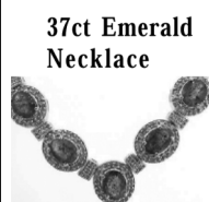
37ct Emerald Necklace

Items relocated at short notice for convenience of sale