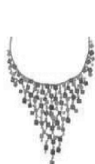
16ct Diamond & 16ct Sapphire Necklace

Mansion Under Contract, Personal Property to be Sold Piece by Piece et al