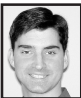
By Cory Soal R.H.A.D.

Drink and drive, and your life may never be the same again. You not only risk your life when you drink and drive, you also risk losing your license, incurring expensive fines, doing time in jail or even causing injury or death to an innocent bystander. With all these consequences facing you, driving under the influence is the worst decision you can make. Don't take chances with drinking and driving; there's always a better alternative.