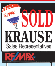
KRAUSE Sales Representatives RE/MAX