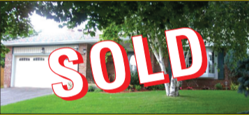
34 Mary Street $420,000