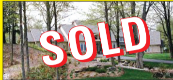
20 Turtle Lake $1,399,900