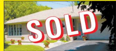
8 Lane Court $324,900