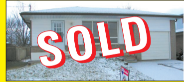
45 Faludon $299,900