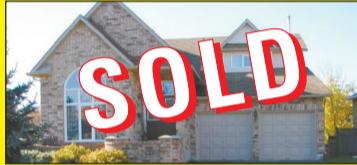
6 Janet $389,900