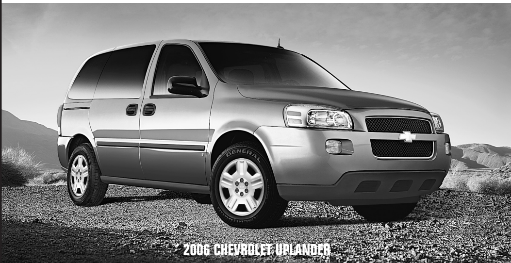
2006 CHEVROLET UPLANDER

HIGHEST GOVERNMENT FRONTAL CRASH SAFETY RATING UPLANDER RECEIVED A 5-STAR RATING FOR THE DRIVER AND FRONT PASSENGER IN THE FRONTAL CRASH TEST.