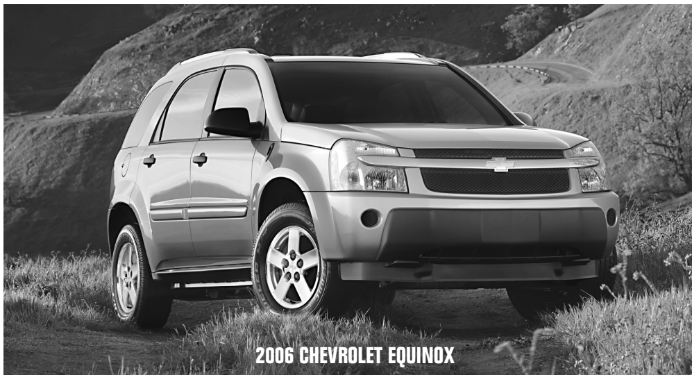
2006 CHEVROLET EQUINOX

E/F HWY: 8.5L/100km . 33 mpg CITY: 12.6L/100km . 22 mpg