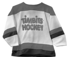
The first goal is having fun.

In Timbits Hockey, having fun and making friends are all part of the drill. Tim Hortons is proud to support the young boys and girls who play Timbits Hockey in Acton and Georgetown - where fun is always front and centre.