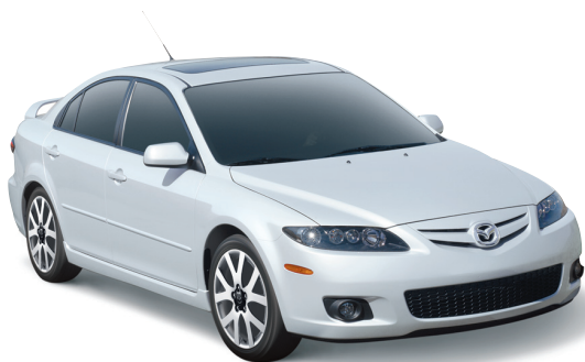
GT-V6 model shown