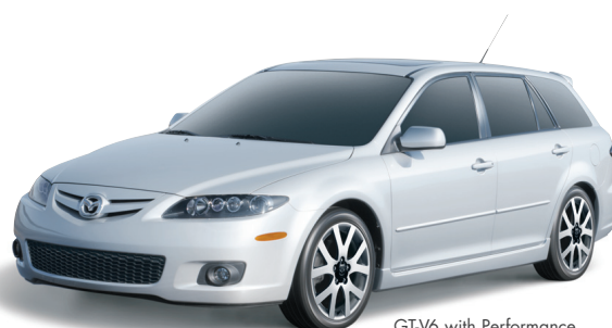
GT-V6 with Performance package model shown

NO SECURITY DEPOSIT LEASE PAYMENT INCLUDES FREIGHT AND P.D.E.