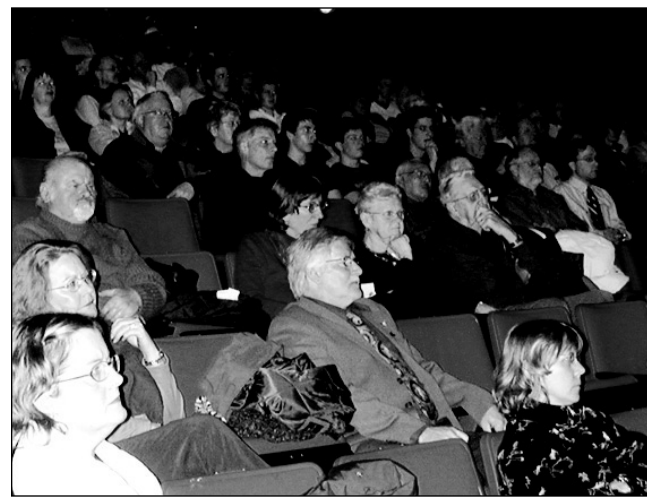
A crowd of nearly 200 people turned out to the John Elliott Theatre Wednesday for an federal election all-candidates meeting.