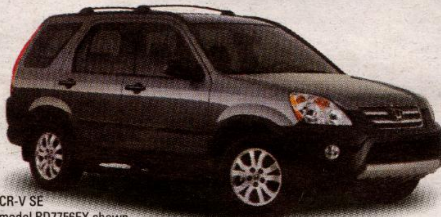
CR-V SE model RD7756EX shown

CR-V SE LEASE FOR 48 MO. LEASE APR PURCHASE FINANCING FROM $338 PER MO. @ 4.9% OR 5.9% FOR UP TO 60 MONTHS PER MO. FOR 48 MONTHS O.A.C. $29,300 † MSRP