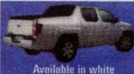
Available in white

RIDGELINE LX LEASE FOR 48 MO. LEASE APR PURCHASE FINANCING FROM $417 PER MO. @ 5.9% OR 5.9% FOR UP TO 60 MONTHS $5128 DOWN WITH $0 SECURITY DEPOSIT $35,200 † MSRP