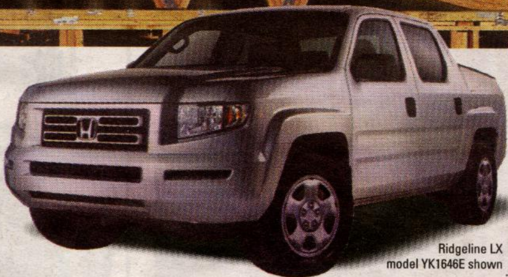
Ridgeline LX model YK1646E shown