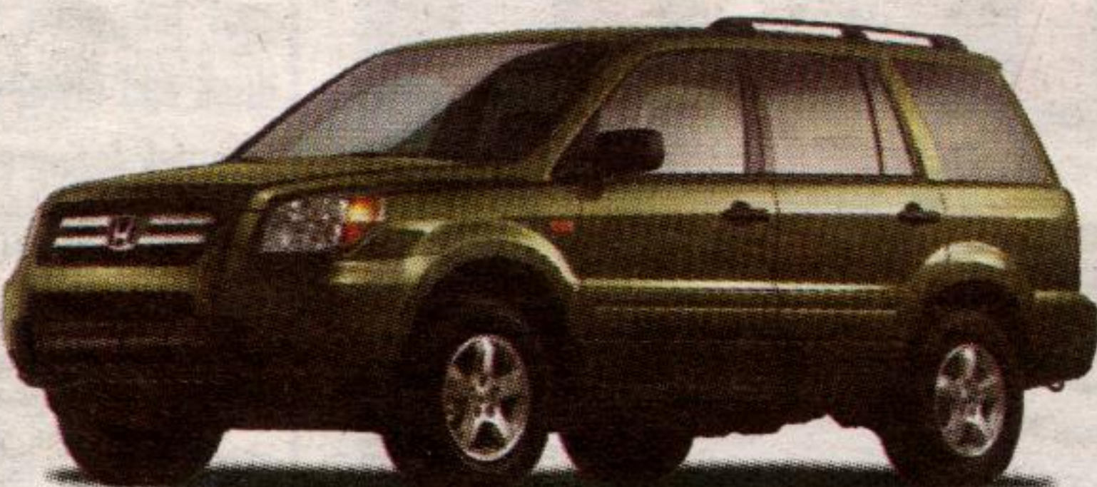
Pilot LX model YF1816E shown

This CR-V Special Edition Trim Package delivers a $2,313 VALUE PRICE ADVANTAGE