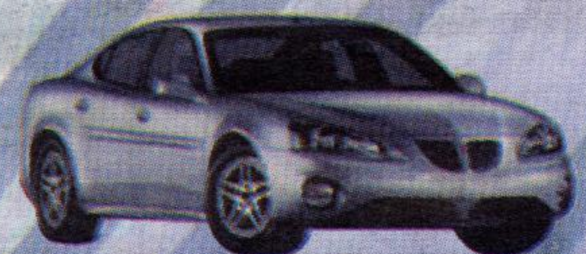
'06 GRAND PRIX

Push The OnStar Button And You Could Win