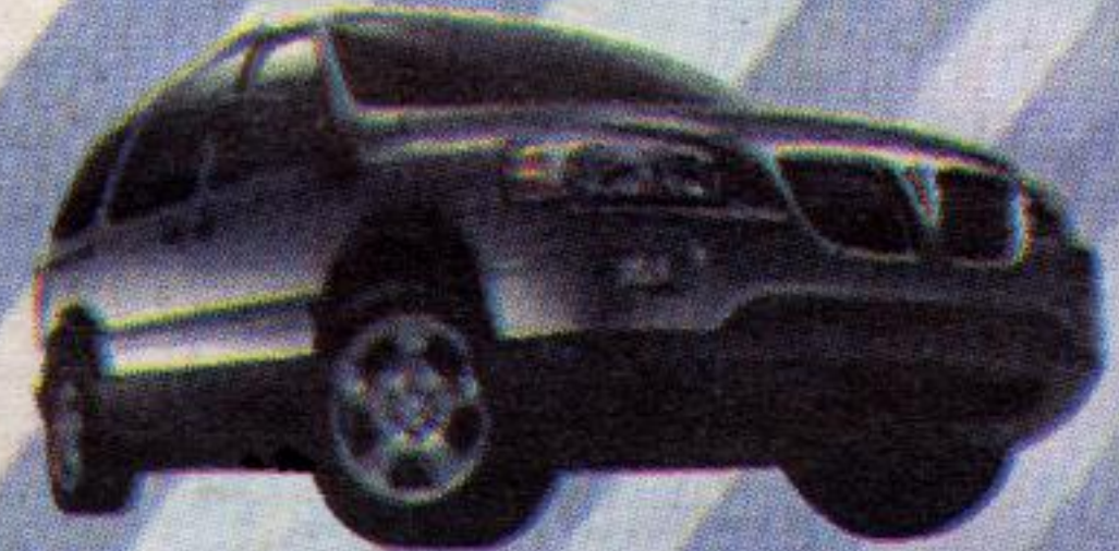
'06 MONTANA SV6