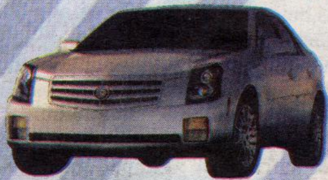
'06 CADILLAC CTS