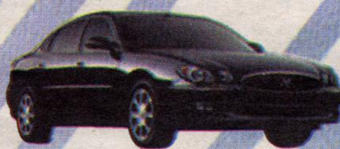
'06 BUICK ALLURE