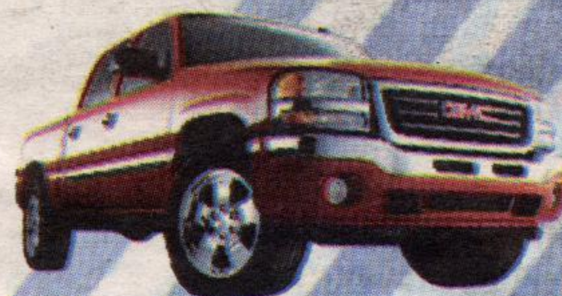
'06 GMC SIERRA