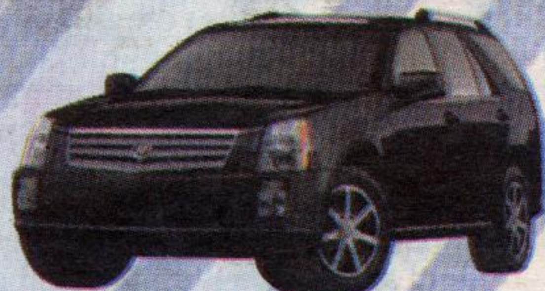
'06 CADILLAC SRX