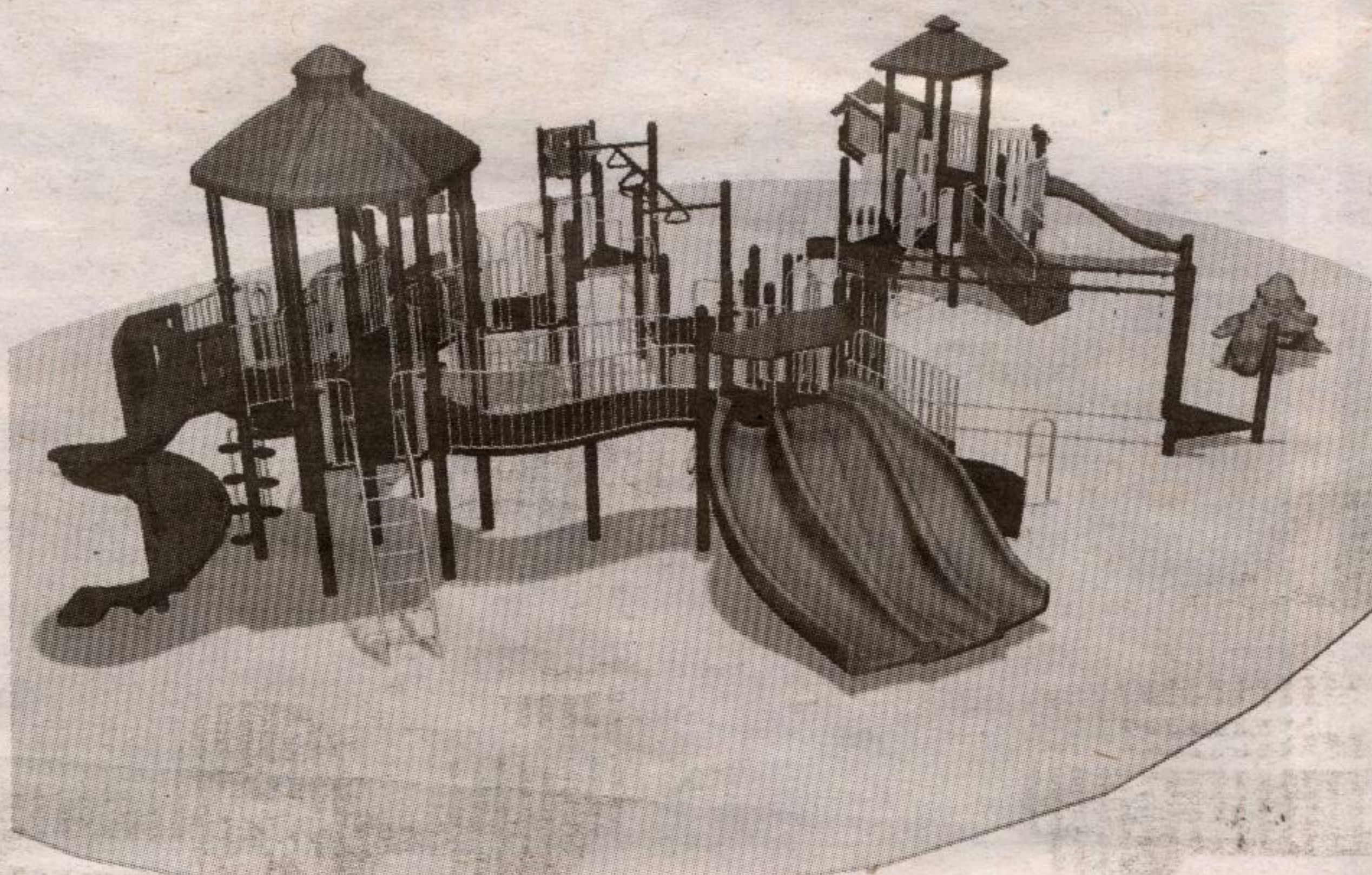
A larger than usual children's playground is one aspect of a new community park planned for Dominion Gardens. Pathway, parking and a pavilion are also in the plans.

Site to be a 'central park' for the entire community