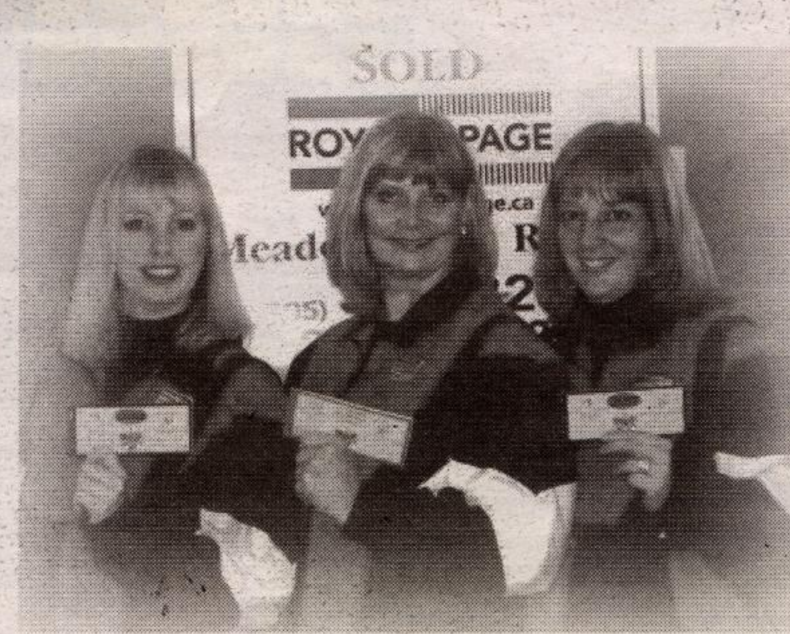
Opportunity Knocks!! $220,000

All the charming details you would expect to find in a character home are here: hardwood floors; brick fireplace with mantle; French Door style upper cabinets in the kitchen; formal dining room with chair-rail; mullioned windows, and sloped ceilings in the upper Master Bedroom. This 3+1 Bedroom 2.5 Bath home includes a 1 Bedroom In-Law Suite.