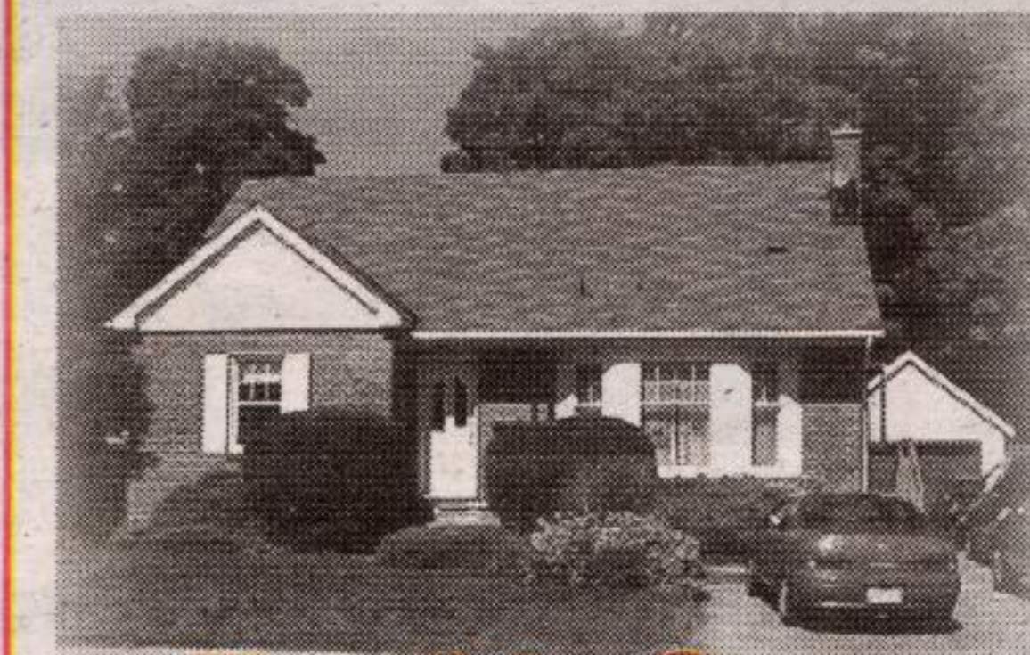
Park Area Charmers $289,900

All the charming details you would expect to find in a character home are here: hardwood floors; brick fireplace with mantle; French Door style upper cabinets in the kitchen; formal dining room with chair-rail; mullioned windows, and sloped ceilings in the upper Master Bedroom. This 3+1 Bedroom 2.5 Bath home includes a 1 Bedroom In-Law Suite.