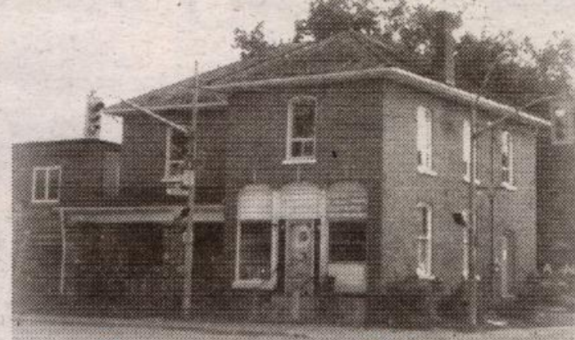
Century Home $325,000

This circa 1890 3 bedroom home which sits on a large 50 ft. x 200 ft. lot was once the United Church manse in the charming village of Erin and has recently been renovated and offers: hardwood floors, new kitchen, large family room addition, original trim, most windows replaced, roof re-shingled in '04, new plumbing and wiring.