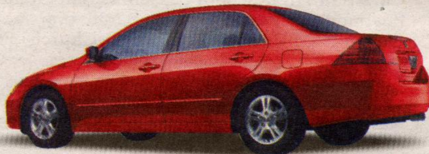
Accord Sedan SE model CM5636J shown

ACCORD DX-G LEASE FOR 48 MO. LEASE APR $298 @ 5.9% $4,466 DOWN WITH $0 SECURITY DEPOSIT ACCORD SE LEASE FOR 48 MO. LEASE APR $318 @ 5.9% $4,528 DOWN WITH $0 SECURITY DEPOSIT PURCHASE FINANCING FROM 4.9% 60 MONTHS $26,000 MSRP