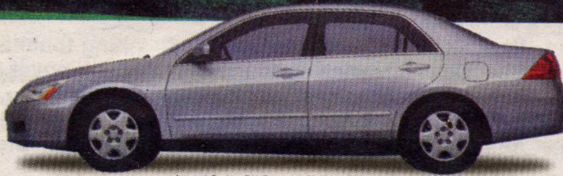
Accord Sedan DX-G model CM5616E shown