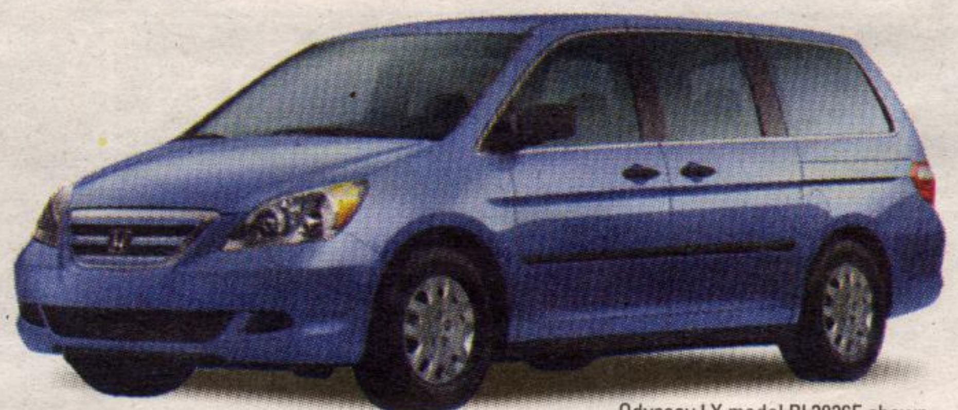
Odyssey LX model RL3826E shown

Seat your family in first class. The benchmark Odyssey minivan puts your family first in safety, performance and fuel efficiency. Top-ranked features include: 3.5L 244hp SAE 2 SOHC V6 VTEC 3 Engine • 5-Speed Automatic Transmission with Grade Logic Control • Vehicle Stability Assist 9 (VSA) 10 • Advanced Compatibility Engineering 11 (ACE) 12 Body Structure • Driver & Front Passenger 6-Airbag System and 3-Row Side Curtain Airbags • 120 Watt AM/FM/CD Audio System • CFC-Free A/C with Manual Front & Rear Controls • Power Windows, Door Locks & Heated Door Mirrors • 3rd Row Retractable Magic Seat 13 ...and more.