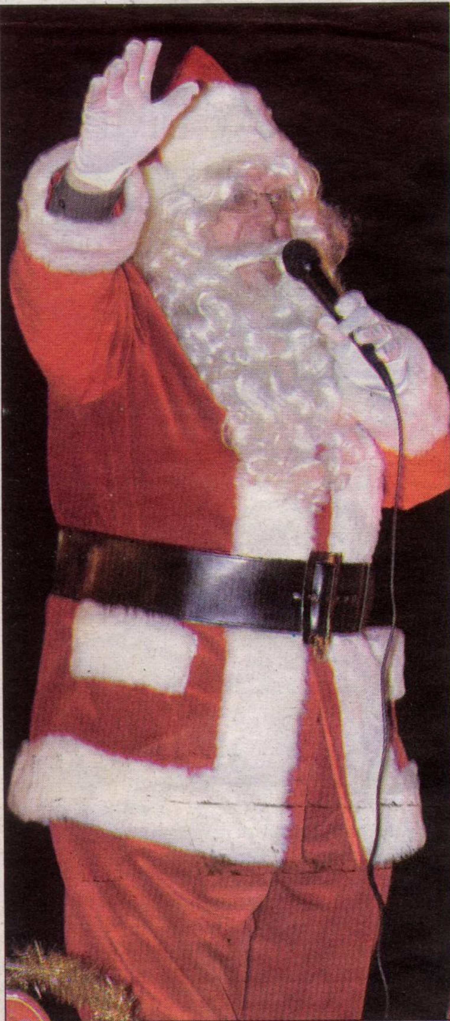
Santa Claus waves to the thousands who lined the parade route Saturday evening.