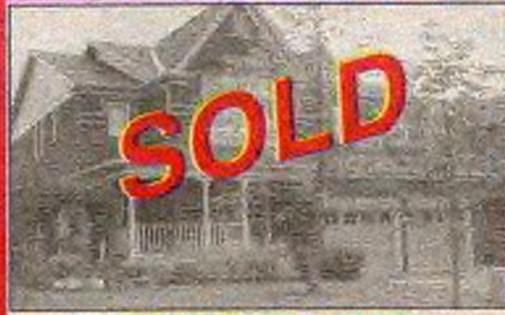
GEORGETOWN - $469,000