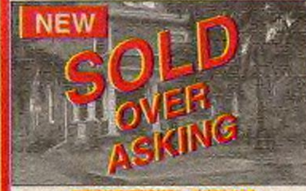
GEORGETOWN - $459,000