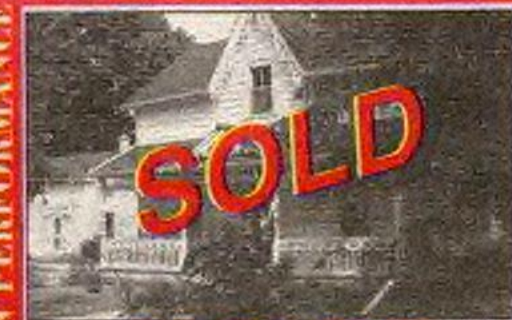
BELFOUNTAIN - $549,000