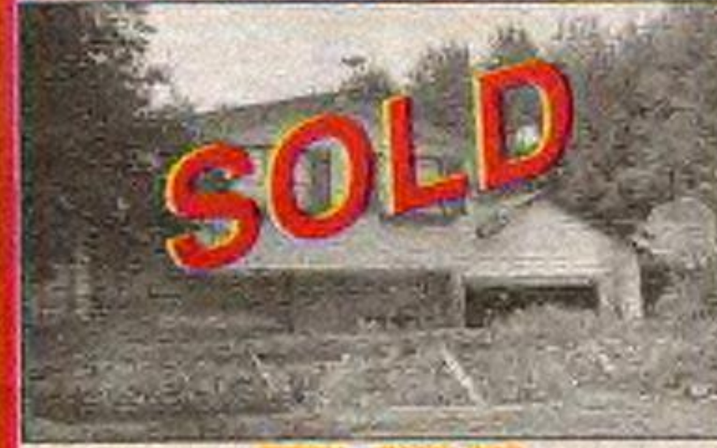
ERIN - $359,000