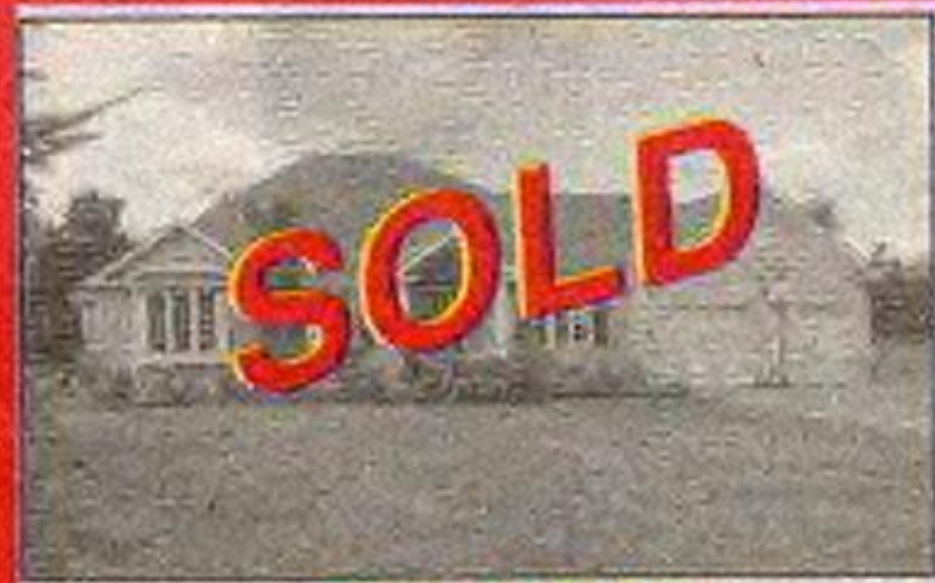
ERIN - $584,000