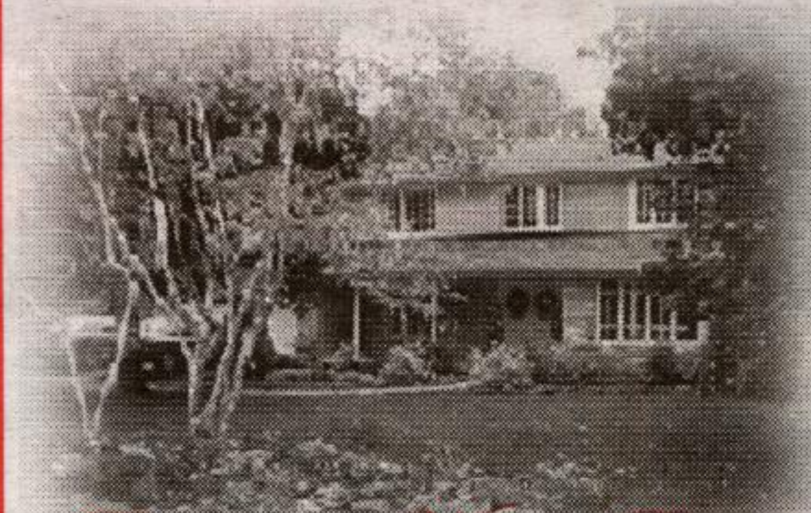
Bramalea Woods Beauty $599,000

Exceptionally well maintained, updated and upgraded family home on a large ravine lot in the exclusive "Bramalea Woods" backing onto Laurel Crest Park and creek. This 4 BR, 4 bath home boasts a prof. finished walkout basement, hot tub and cabana, gas fireplaces, and a family room, office and laundry all on the main floor. Viewings by appt. only.