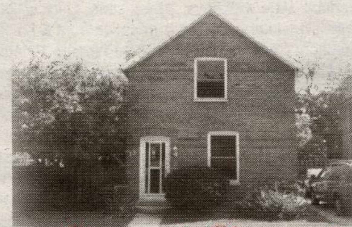
Location! Location! $349,900

This spotless, 3 BR brick bungalow, on a 1/2 acre lot minutes from town, has been upgraded with new: laminate floors & neutral decor; low maintenance windows; main bath w/ceramics, whirlpool corner tub & separate shower, 12 x 16 ft deck, forced air GAS furnace and the nearly complete rec room has a r/i woodstove.