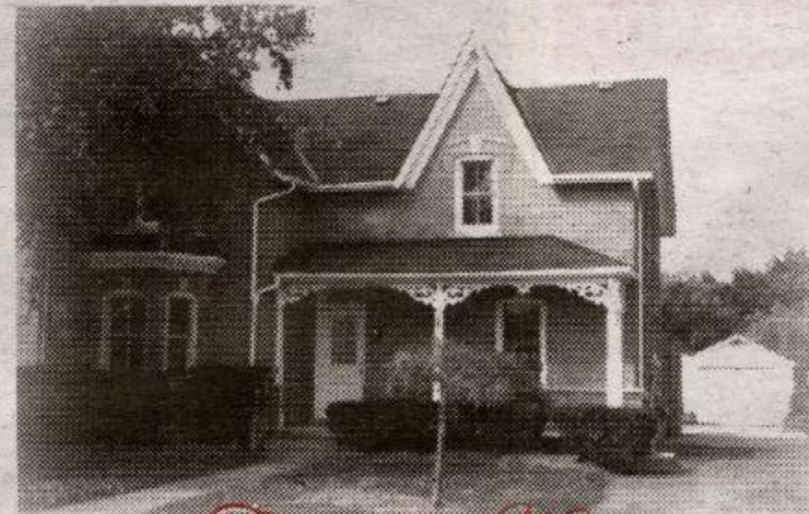
Century Home $334,900

Exceptionally well maintained, updated and upgraded family home on a large ravine lot in the exclusive "Bramalea Woods" backing onto Laurel Crest Park and creek. This 4 BR, 4 bath home boasts a prof. finished walkout basement, hot tub and cabana, gas fireplaces, and a family room, office and laundry all on the main floor. Viewings by appt. only.