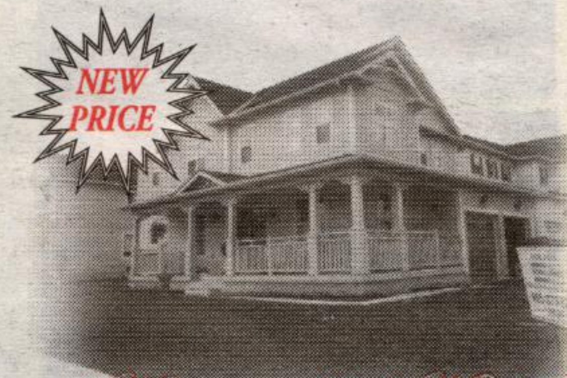
"Honeysuckle" Model $339,900

Located in the heart of Streetsville less than a block south of Queen Street this 2 bedroom, 2 bath, 2 storey, brick home sits on a 60 ft. x 100 ft. lot and has been renovated over the last few years including: roof (1999), furnace (1997), newer wiring, strip hardwood floors and a master bedroom with a 3 piece ensuite.