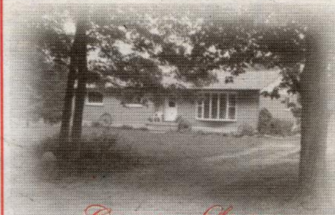
Country Living $300,000

All the charming details you would expect to find in a character home are here: hardwood floors; brick fireplace with mantle; French Door style upper cabinets in the kitchen; formal dining room with chair-rail; mullioned windows, and sloped ceilings in the upper Master Bedroom. This 3+1 Bedroom 2.5 Bath home includes a 1 Bedroom In-Law Suite.