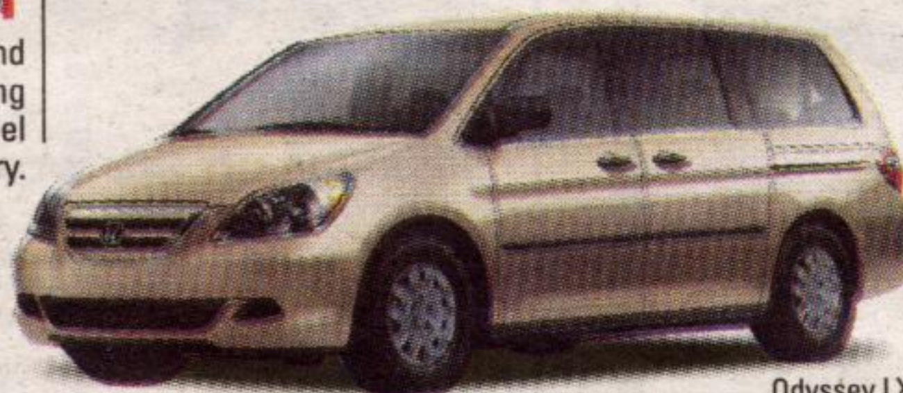
Odyssey LX model RL3826E shown

The benchmark in safety, performance, and fuel efficiency. Odyssey offers the interior comfort and convenience that turns "Are we there yet?" into "Are we there already?" With Honda's outstanding "Safety for Everyone" features, a responsive 244hp SAE 1 V6 VTEC ® engine and legendary fuel economy, it's no wonder the Odyssey is a family favourite right across the country.