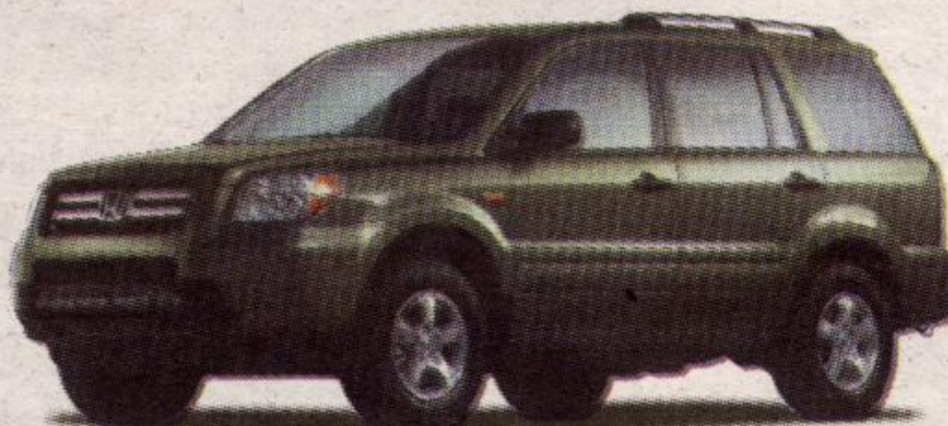
Pilot LX model YF1816E shown

For powerful styling, versatility and fuel efficiency, this is the go-to SUV. With a striking new front end design, the 8 passenger Pilot with a 244hp SAE 1 V6 VTEC ® engine offers the best fuel efficiency in its class 2 . Honda's "Safety for Everyone" features and exceptional interior comfort make it perfect for your adventurous family.