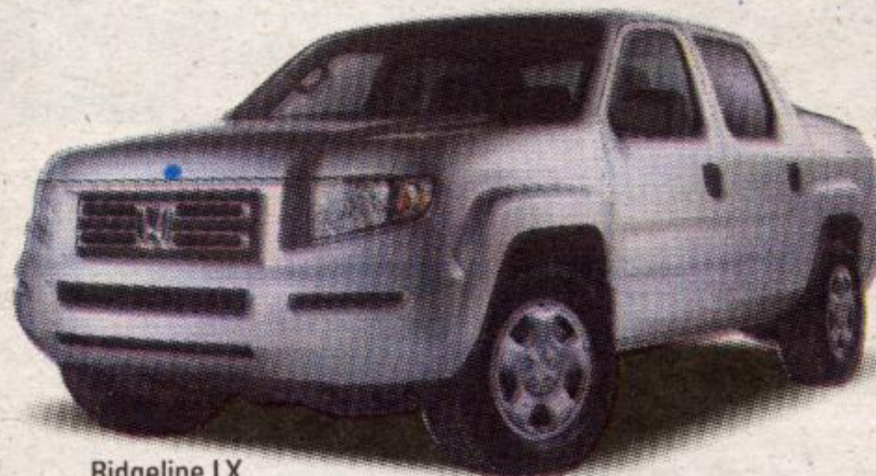
Ridgeline LX model YK1646E shown

PILOT LX LEASE FOR LEASE APR PURCHASE FINANCING FROM $418 † @ 3.9% ‡ OR 5.9% ‡ FOR UP TO 60 MONTHS PER MO. FOR 48 MONTHS O.A.C. O.A.C. MSRP $39,400 †