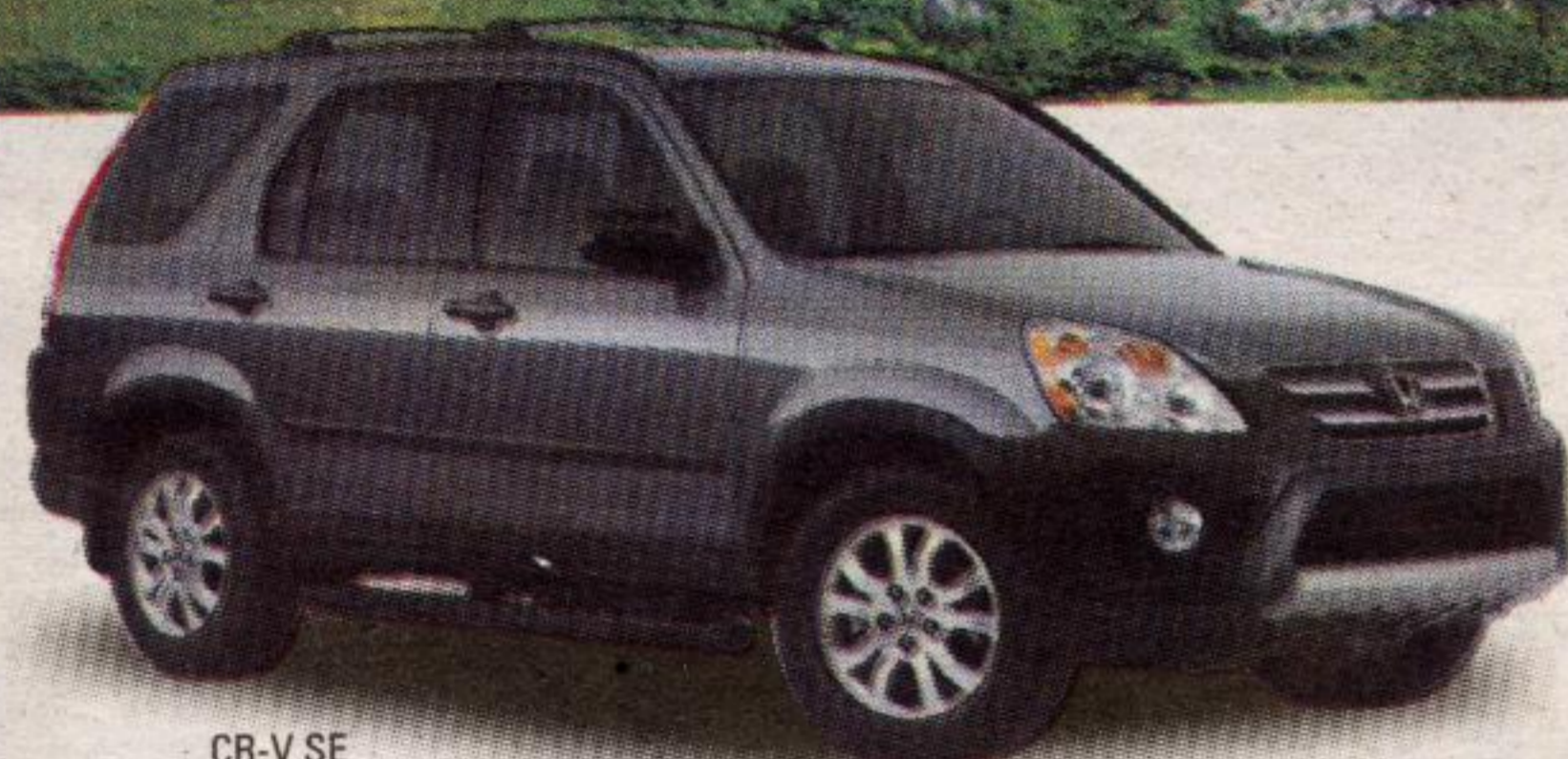
CR-V SE model RD7756EX shown