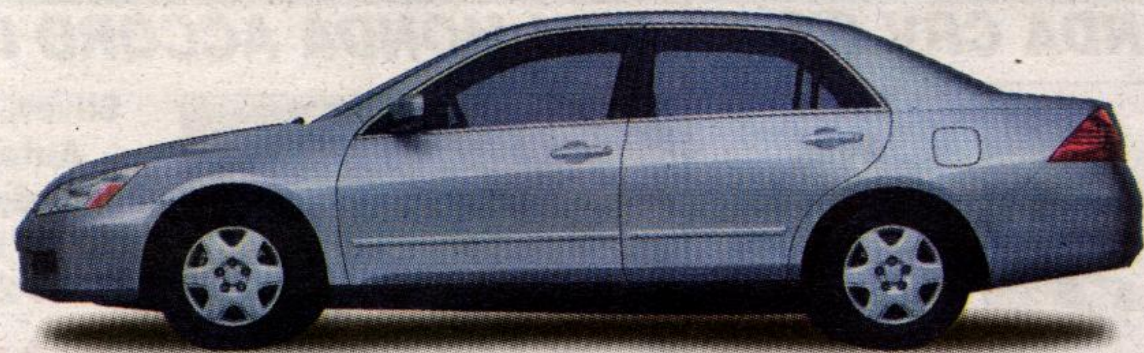
Accord Sedan DX-G model CM5616E shown