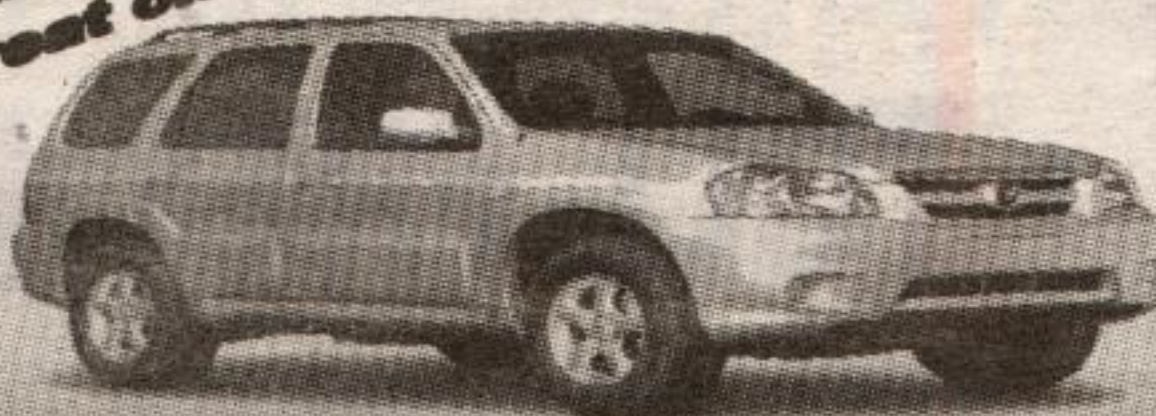
2006 Mazda Tribute

2006 Tribute 0% Financing 4 Cyl. Great on Fuel